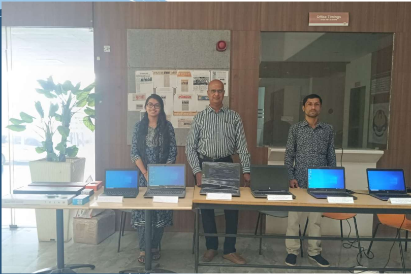
Dated 22 April 2023, Laptop Sale on the Occasion of Akshay Tritiya