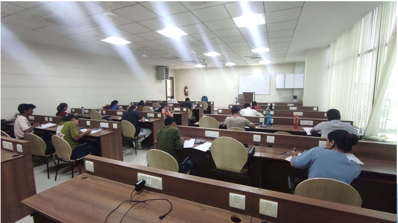
Dated 5 to 14 April 2023, Mock Test Series 2 for Inter & Final